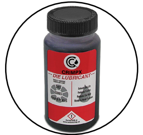
CRIMPX Die Lubricant: Oil 4 oz bottle with dauber cap (Included) P/N:103886