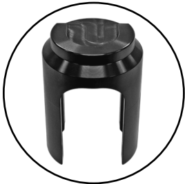
Pusher P/N:100825 (Included)