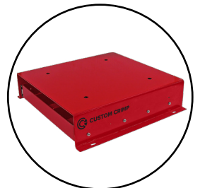
D-Series Stand/Drawer (Optional) P/N:104650-Red