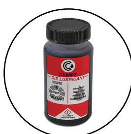
CRIMPX Die Lubricant: 4 oz bottle oil with dauber cap (Included) P/N:103886