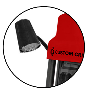
Flexible 24" Work Lamp (Optional) P/N:1668-02