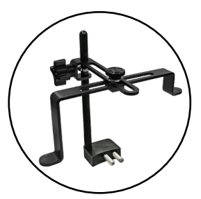
D165 Coupling Stop (Included) P/N:100954