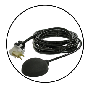
Pneumatic Pendent Switch (Included) P/N:101349