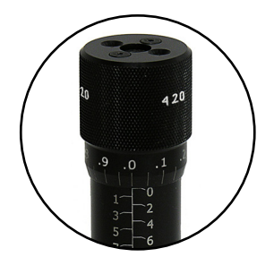
T420 Micrometer (Included) P/N:103085