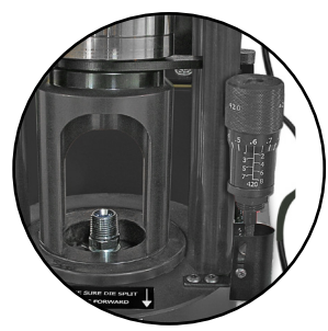
Automatic stop switch: shuts the pump off when the crimp cycle is complete.