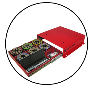
Die Storage Drawer (Optional) P/N:104650-Red Accessories sold separately