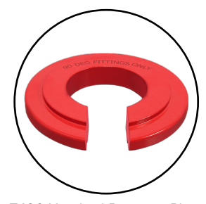
T420 Notched Pressure Plate (Optional) P/N:104662