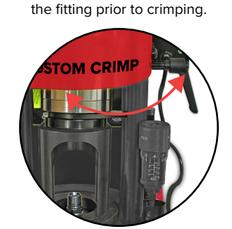
Save Time: Adjustable retraction stop limits ram retraction for quick repetitive crimps.