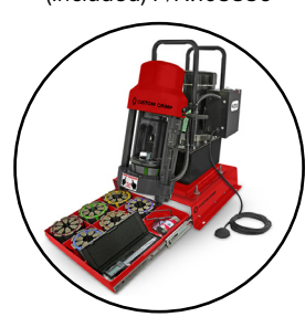
Crimper shown mounted on the Die Storage Drawer