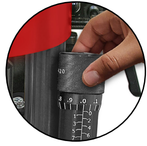
Accurate and Repeatable: Micrometer with "Micro-Crimp Adjuster" is fully adjustable to make precise and repeatable crimps.