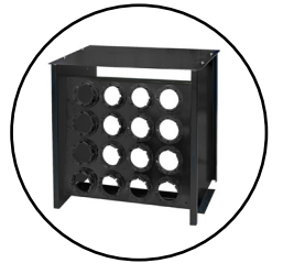
Crimper Stand 16 Station Die Holders (Available) P/N:101247-99