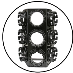
Die Rack 9 Station Die Holders (Available) P/N:102616-99MM