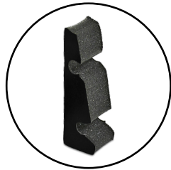
Protective Master Die Foam Pads (Installed) P/N:102530