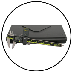
Bluetooth Digital Calipers (Included) Calipers P/N:105002 Bluetooth Dongle P/N:104996