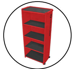
Industrial Die Compartment (Available) P/N:103572-Red