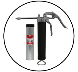
14 oz Grease Gun w/ CRIMPX Die Lubricant 14 oz large grease tube (Included) P/N:105059