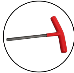
Intermediate Die Removal T-Handle Hex (Included) P/N:104355