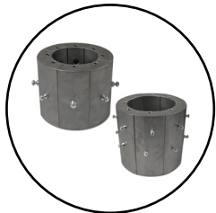
Adapter Die Set 160S (Included) Adapter Die Set 230XL (Included)