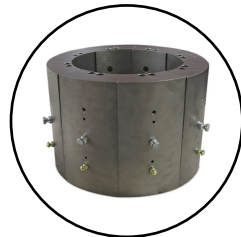
Adapter Die Set 330S (Included)