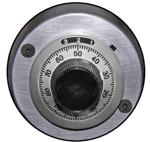
Metric Dial Micrometer