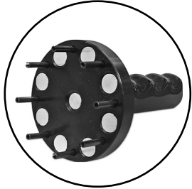
84mm Quick Change Tool (Included) P/N:102572