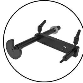
Manual Back Stop (Included) P/N:MBS-60