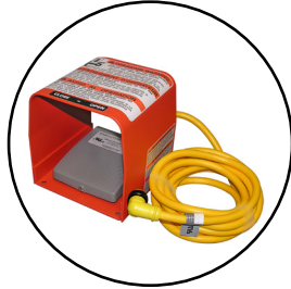
Foot Pedal Assembly (Included) P/N:104118