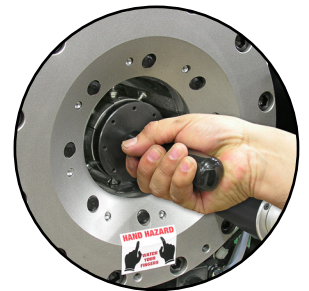
Quick Change Tool