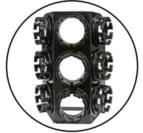
Die Rack 9 Station Die Holders (Included) P/N:102616-84mm