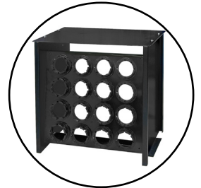
Available: Crimper Stand 16 Station Die Holders P/N:101247-84