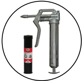
Mini Grease Gun w/ CRIMPX Die Lubricant 3 oz mini grease tube (Included) P/N:103889