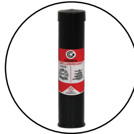
Available: CRIMPX Die Lubricant 3 oz mini grease tube P/N:103887