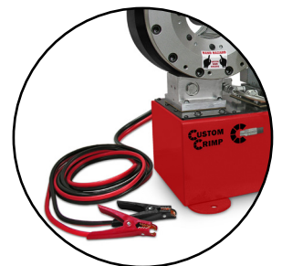
Available in 12VDC/24VDC