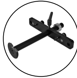
(Included) Manual Back Stop P/N:103907