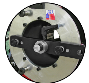
Save Time: Manual Back Stop for multiple crimps of the same hose and fitting.