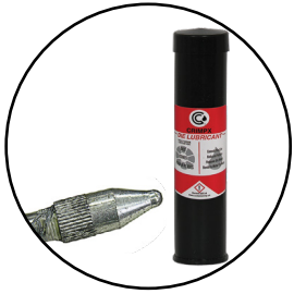
(Included) CRIMPX Lubricant Grease 3 oz mini grease tube P/N:103887 and grease nipple