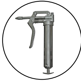
(Optional) Mini Grease Gun P/N:103889

The 1 HP motor delivers the power needed to get the job done quickly