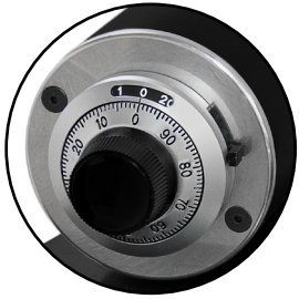
(Included) Metric Dial Micrometer P/N:102941-600