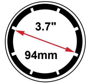
Max. Head Opening W/O Dies