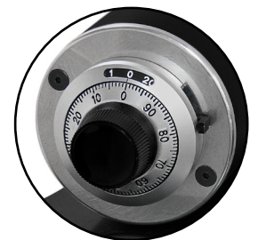
Metric Dial Micrometer