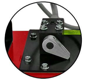
Hold/Release valve: Permits the operator to jog and hold the dies in and position during setup.