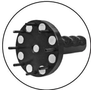
84mm Quick Change Tool (Included) P/N:102572

The features found on the CC30 Series hose crimper and the accessories included make it the best value of any crimper in its class.