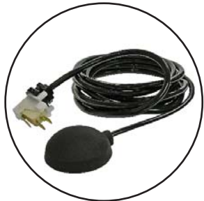
Pneumatic Pendant Switch (Included) P/N:101349