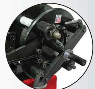
Save Time: Removable back stop for multiple crimps of the same hose and fitting.