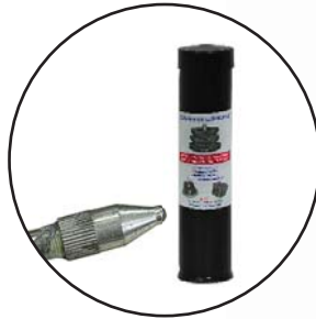
CRIMPX Lubricant Grease 3 oz mini grease tube P/N:103887 and grease nipple (Included)