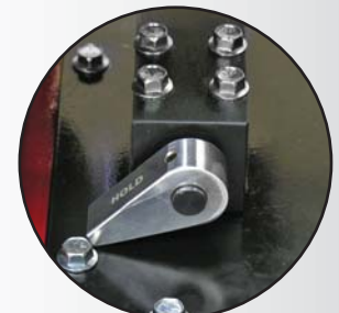
Hold/Release valve: Permits the operator to jog and hold the dies in and position during setup.