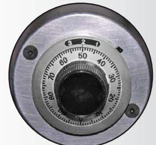
Micrometer Style Adjustment: Provides speed, precision and repeatability.