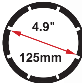
Max Head Opening W/O Dies