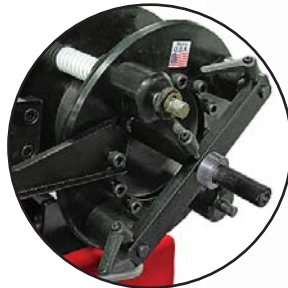
Manual Back Stop (Included) P/N:MBS-30