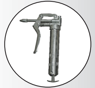
Mini Grease Gun (Optional) P/N:103889

Large opening allows right angles and special fittings to be inserted