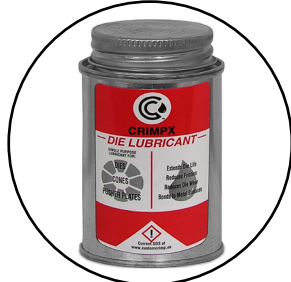
CRIMPX Die Lubricant: Grease 4 oz can with brush P/N:104162