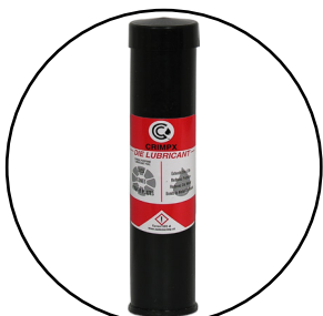
CRIMPX Die Lubricant: Grease 3 oz mini grease tube P/N:103887