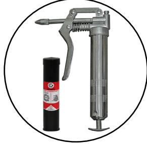
CRIMPX Grease Gun: Mini grease gun with 3 oz mini grease tube P/N:103889