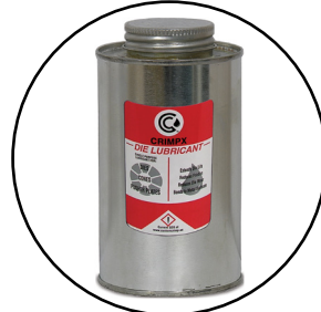
CRIMPX Die Lubricant: Grease 16 oz can with brush P/N:104111