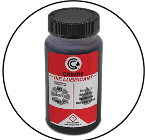
CRIMPX Die Lubricant: Oil 4 oz bottle with dauber cap P/N:103886

Innovating SMART Hose Assembly Solutions Since 1979