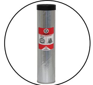
CRIMPX Die Lubricant: Grease 14 oz large grease tube P/N:103888