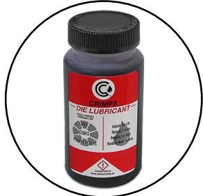
CRIMPX Die Lubricant: Oil 4 oz bottle with dauber cap P/N:103886

CrimpX Die Lubricant is a protective coating that wraps dies and crimper components in a protective layer that lubricates and protects both dies and crimper components. CrimpX is available exclusively from CustomCrimp®.