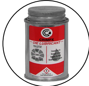
CRIMPX Die Lubricant: Grease 4 oz can with brush P/N:104162