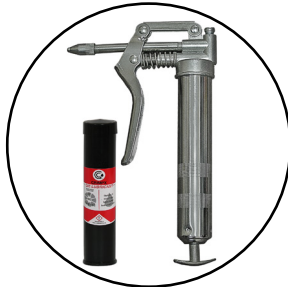
CRIMPX Grease Gun: Mini grease gun with 3 oz mini grease tube P/N:103889