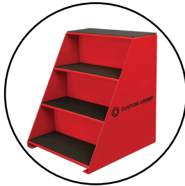
Die Storage Shelf (Optional) P/N:101431-Red