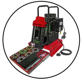
Crimper shown mounted on the Die Storage Drawer

1HP/110V/Single Phase pump for fast crimps