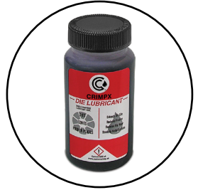
CRIMPX Die Lubricant: 4 oz bottle oil with dauber cap (Included) P/N:103886