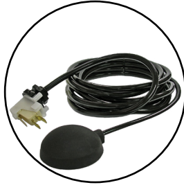
Pneumatic Pendant Switch (Included) P/N:101349