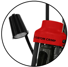
Flexible 24" Work Lamp (Optional) P/N:1668-02