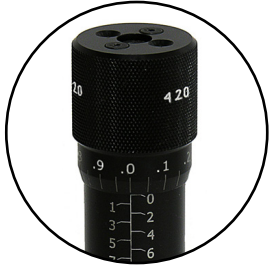
T420 Micrometer (Included) P/N:103085