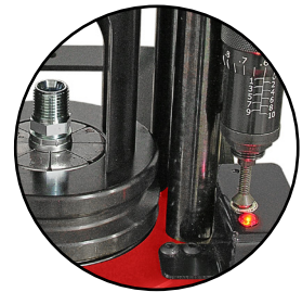
LED Indicator Light: will turn on to indicate that the crimp is complete.

two piece "slide in" die set and removable pusher allows the operator to accurately position the fitting prior to crimping