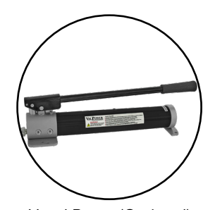
Hand Pump (Optional) P/N:VHP-10-43