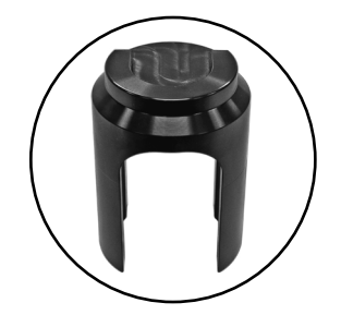
Pusher P/N:100825 (Included)