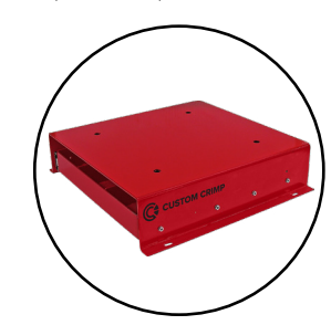
D-Series Stand/Drawer (Optional) P/N:104650-Red