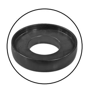
Pressure Plate (Included) P/N:102211