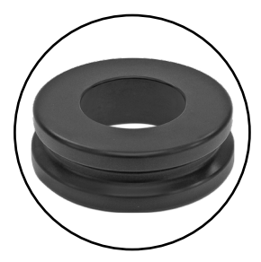
Compression Ring (Included) P/N:102213