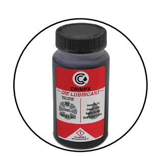
CRIMPX Die Lubricant: Oil 4 oz bottle with dauber cap (Included) P/N:103886