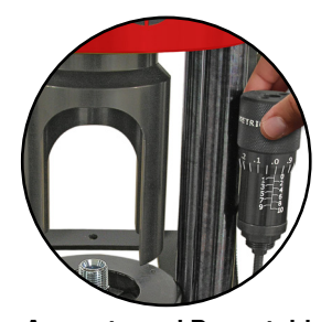
Accurate and Repeatable: Adjustable micrometer and the LED indicator light make precise and repeatable crimps.