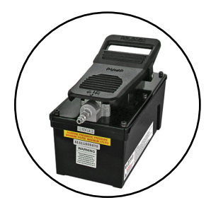
Pneumatic Pump (Optional) P/N:VAP-10-100