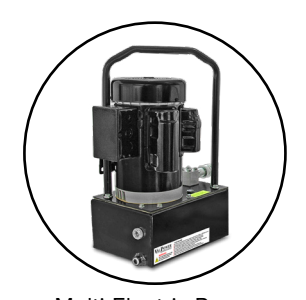
Multi-Electric Pump 110V/Single Phase (Optional)