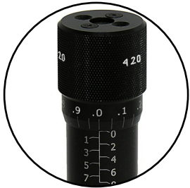
T420 Micrometer (Included) P/N:103085