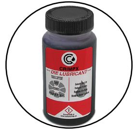
CRIMPX Die Lubricant: Oil 4 oz bottle with dauber cap (Included) P/N:103886