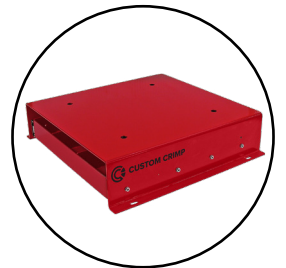
D-Series Stand/Drawer (Optional) P/N:104650-Red