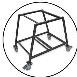
(Optional) Mobile Cart P/N:101956