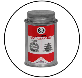
(Included) CRIMPX Lubricant Grease 4 oz can with brush P/N:104162