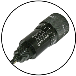
(Included) Metric Micrometer P/N:101587