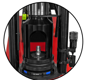
Electronic Stop Switch