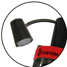
(Included) Flexible 24" Work Lamp P/N:1668-02