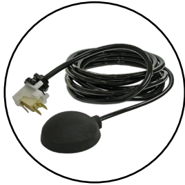
(Included) Pneumatic Pendant Switch P/N:101349