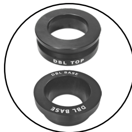
(Optional) Double Angle Top P/N:100871 (Optional) Double Angel Base P/N:100870