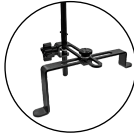
(Included) D205/D206 Coupling Stop P/N:101631