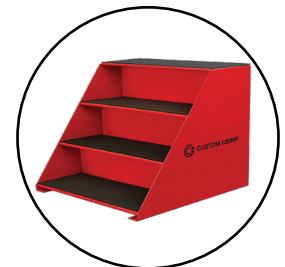
(Optional) D205/D206 Die Storage Shelf P/N:101625 (Red)