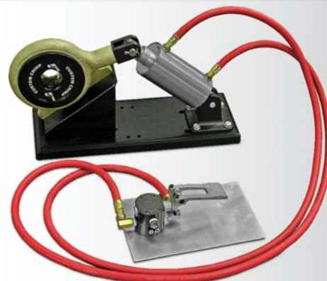
670-T Air operated