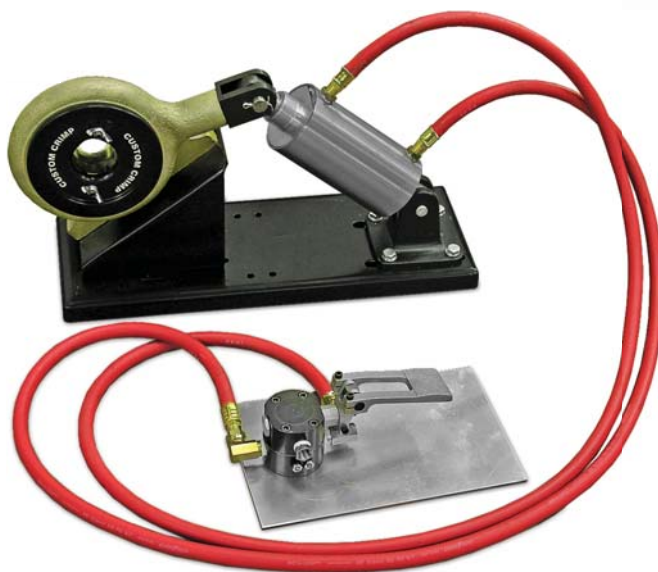
670-T Air operated