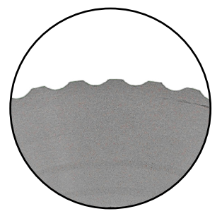
Scalloped Blade (General Purpose):

Is recommended to cut multi-spiral hose.