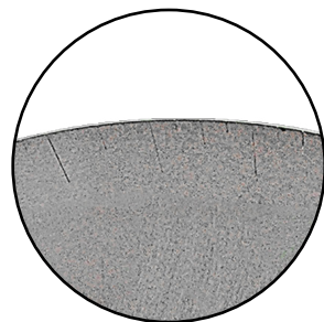
Double Bevel Blade with SS Slots: Is recommended for braided hose with minimum debris during the cut.

Is recommended to cut multi-spiral hose.