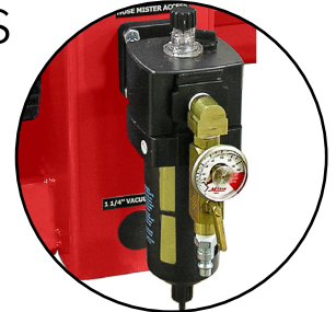
Mister Hose Assembly