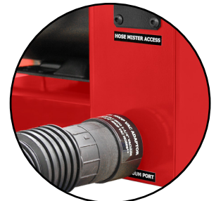
Available Vacuum Port