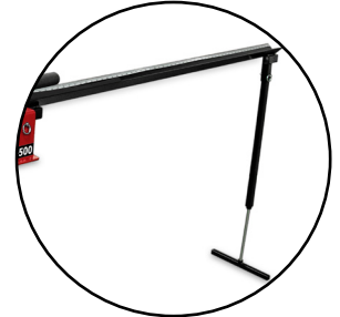
Hose Channel System