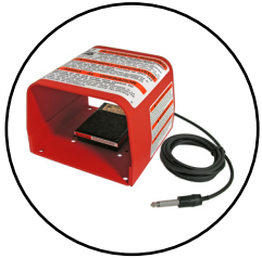
CC-Foot Switch (Included) P/N:CC-FOOTSWITCH