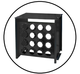
Crimper Stand 16 Station Die Holders (Available) P/N:101247-99