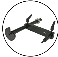
Manual Back Stop (Included) P/N:MBS-60