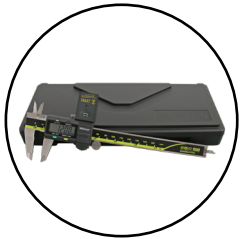
Bluetooth Digital Calipers (Included) Calipers P/N:105002 Bluetooth Dongle P/N:104996