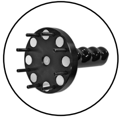
99mm Quick Change Tool (Included) P/N:102571