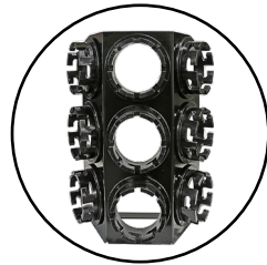
Die Rack 9 Station Die Holders (Available) P/N:102616-99MM