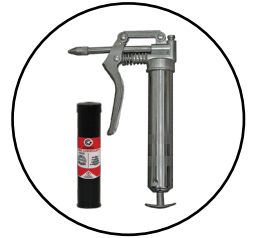
Mini Grease Gun w/ CRIMPX Die Lubricant 3 oz mini grease tube (Included) P/N:103889