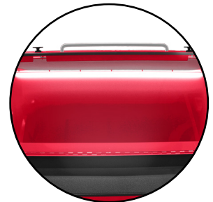
Built-In Work Light