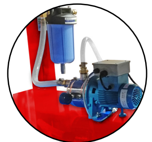
Available 90 PSI Booster Pump