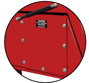
Removable Side Panel