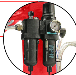
Regulated Air Inlet (Filter / Lubricator)