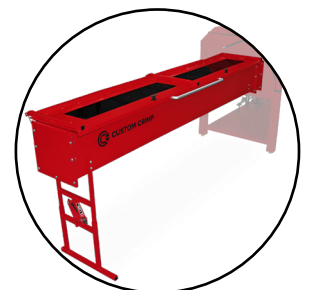
Available Extension Trough