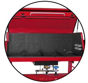
Large capacity cabinet to make large hose loading easy