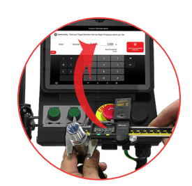
InfoCrimp<sup>™</sup> technology supports bluetooth calipers to input crimp diameter measurements