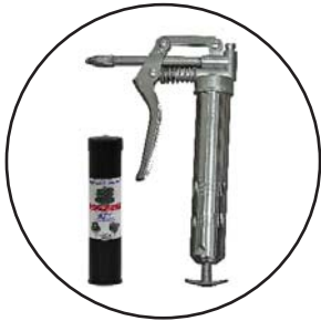
Mini Grease Gun w/ CRIMPX Die Lubricant 3 oz mini grease tube (Included) P/N:103889