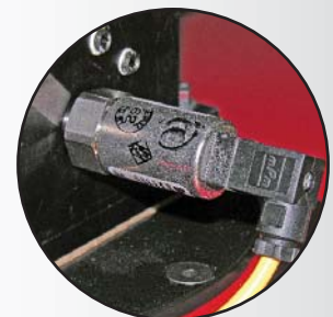
Pressure Compensation: Uses pressure to eliminate "trial and error".

Products covered by all or some of these Patents: US 7,383,709; US 8,230,714; EP 1,909,987 and Patents Pending.