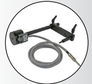
Electronic Back Stop (Optional) P/N:EBS-60