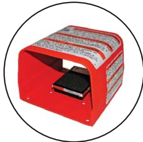
CC-Foot Switch (Included) P/N:CC-FOOTSWITCH