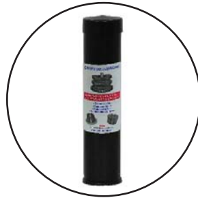
Available: CRIMPX Die Lubricant 3 oz mini grease tube P/N:103887