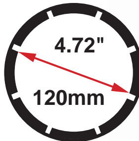
Max Head Opening W/O Dies