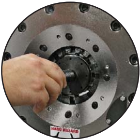
84mm Quick Change Tool (Included) P/N:102572

The features found on the CC38 Series hose crimper and the accessories included make it the best value of any crimper in its class.