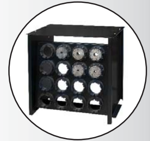
Crimper Stand 16 Station Die Holders (Optional) P/N:101247-84