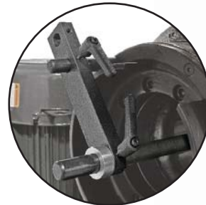
Manual Back Stop (Included) P/N:MBS-60