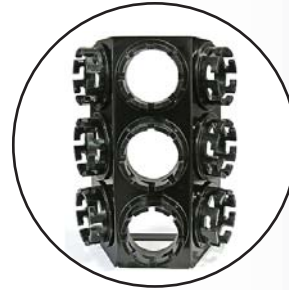
Die Rack 9 Station Die Holders (Optional) P/N:102616-84mm