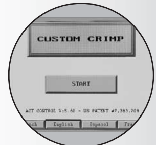
Patented ACT™ Controller: Offers 4 language settings to choose from English, Espanol, Deutsch and Francais.