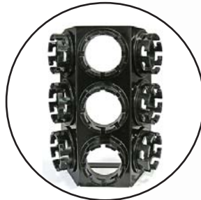
Die Rack 9 Station Die Holders (Optional) P/N:102616-99mm