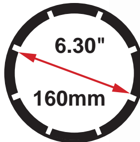
Max Head Opening W/O Dies