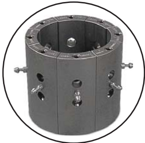
Adapter Die Set 130mm OD to 99mm ID (Included) P/N:101575