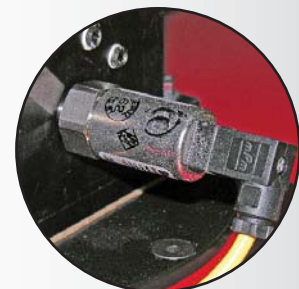
Pressure Compensation: Uses pressure to eliminate "trial and error".

Products covered by all or some of these Patents: US 7,383,709; US 8,230,714; EP 1,909,987 and Patents Pending.