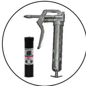
Mini Grease Gun w/ CRIMPX Die Lubricant 3 oz mini grease tube (Included) P/N:103889