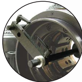
Manual Back Stop (Included) P/N:MBS-60