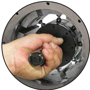
99mm Quick Change Tool (Included) P/N:102571

The features found on the CC4-50 Series hose crimper and the accessories included make it the best value of any crimper in its class.