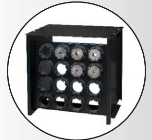
Crimper Stand 16 Station Die Holders (Optional) P/N:101247-99