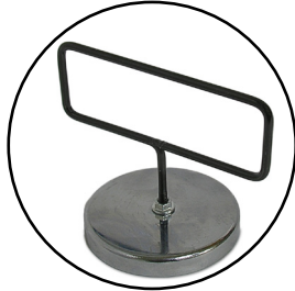
T420/D Series Die Removal Magnet (Included) P/N:104679