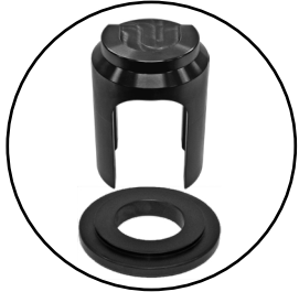
Tooling (Included) Pusher P/N:100825 & T420 Pressure Plate P/N:103270