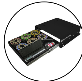
Die Storage Drawer (Optional) P/N:104650-Black Accessories sold separately