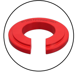
Notched T420 Pressure Plate (Optional) P/N:104662