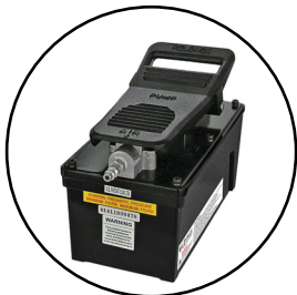
Pneumatic Pump (Optional) P/N:VAP-10-100