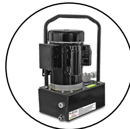
Multi-Electric Pump 110V/Single Phase (Optional)