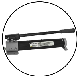
Hand Pump (Optional) P/N:VHP-10-43