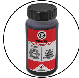
CRIMPX Die Lubricant: Oil 4 oz bottle with dauber cap (Included) P/N:103886