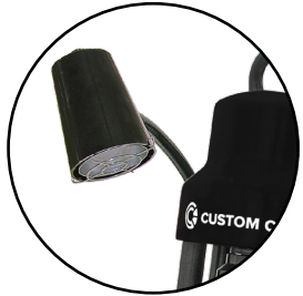
Flexible 24" Work Lamp (Optional) P/N:1668-02