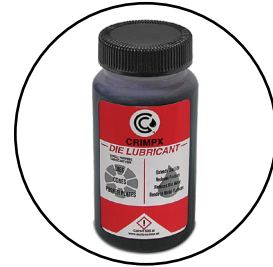
CRIMPX Die Lubricant: 4 oz bottle oil with dauber cap (Included) P/N:103886