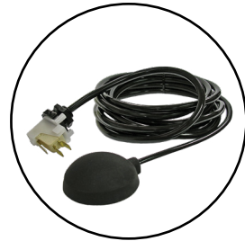
Pneumatic Pendant Switch (Included) P/N:101349