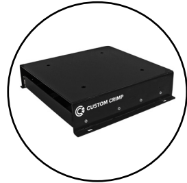
D-Series Stand/Drawer (Optional) P/N:104650-Black