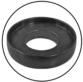
Pressure Plate (Included) P/N:102211