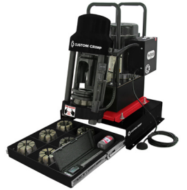
Crimper shown mounted on the die storage drawer.