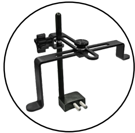
D165 Coupling Stop (Included) P/N:100954