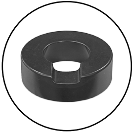
Notched Compression Ring (Optional) P/N:103072