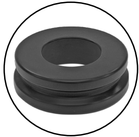
Compression Ring (Included) P/N:102213