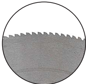
Serrated Blade (General Purpose): Is recommended to cut multi-spiral hose.

These rugged, HS-150 / HS-300 / HS-500 dependable saws offer features not found on other saws. Choose the one with the capacity and features which meet your individual requirements.