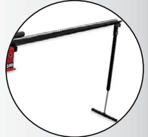
Hose Channel System