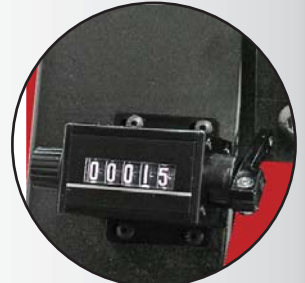
Hose Saw Counter