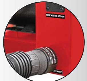
Available Vacuum Port