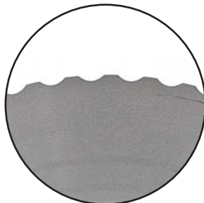
Scalloped Blade (General Purpose): Is recommended to cut multi-spiral hose.