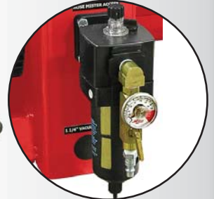
Mister Hose Assembly