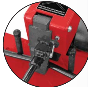
Hose Bending Pins